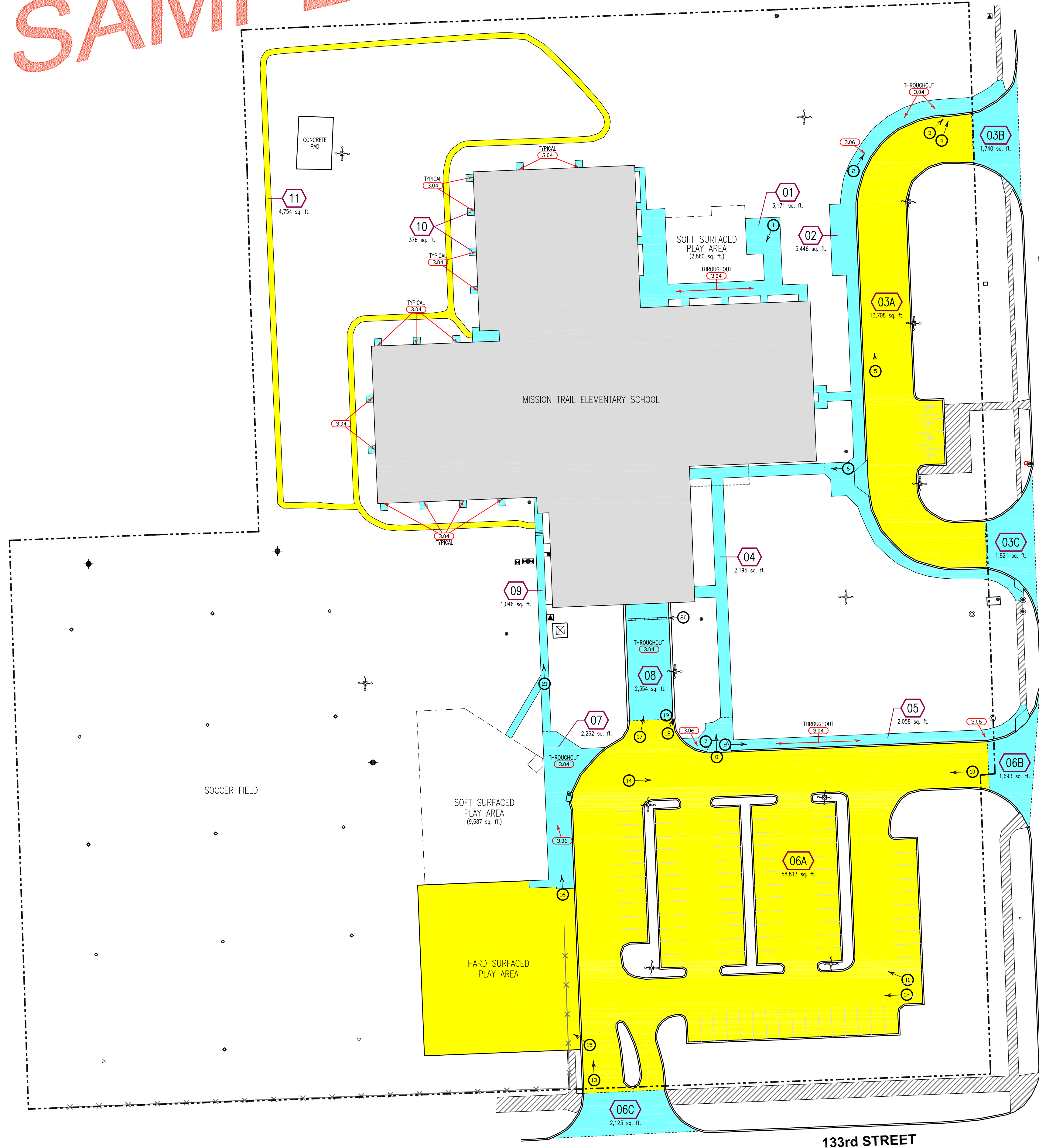
Pavement Plan SCALE: 1" = 40'-0"